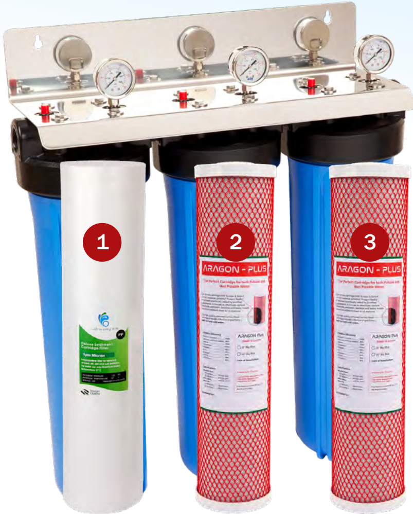
Item No. 4023

Caleffi Pressure Reducing Valves Made in Italy