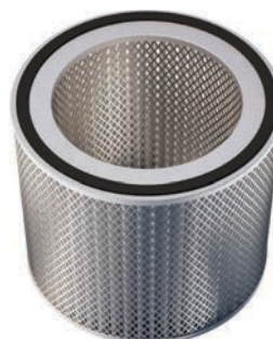
H13 Medical-grade HEPA Filter