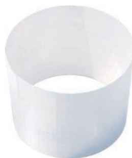
High Efficiency Pre-Filter