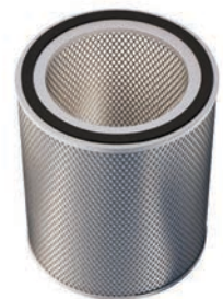
6kg (13.2lbs) Carbon Filter (Coconut Shell)