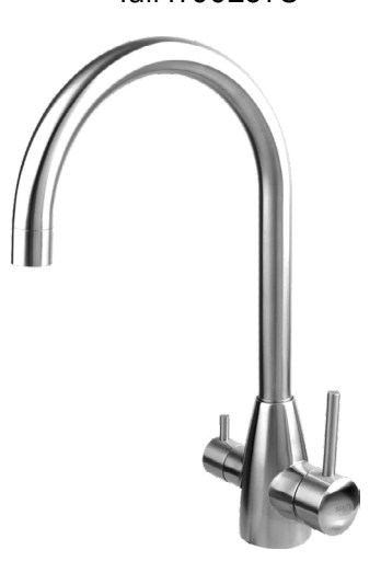
High Loop H 400mm x W 225mm IT001166