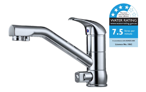
3 Way H 180mm x W 245mm IT001165

Our 3 Way, Nova, Side Lever, Stainless Steel Premier and Stainless Steel High Loop Mixers have been registered according to the requirements of the WELS standard (AS/NZS 6400:2016 water efficient products). For more information please visit www.watershop.com.au/mixers.