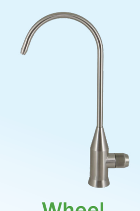
Spring Loaded H 310mm x W 120mm IT003381