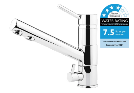
Nova H 210mm x W 200mm IT001980