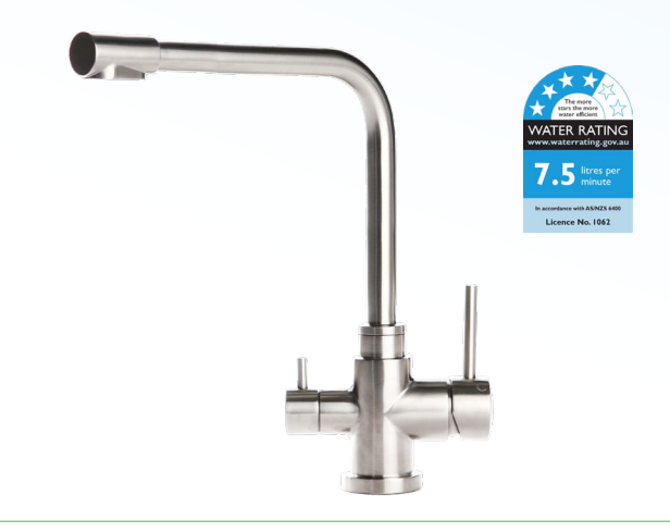
H 360mm x W 240mm Tall IT001678