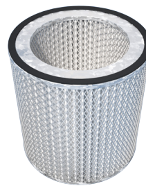
H13 Medical-grade HEPA Filter