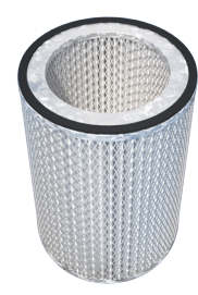
6kg (13.2lb) Carbon Filter (Coconut Shell)