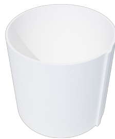
High Efficiency Pre-Filter