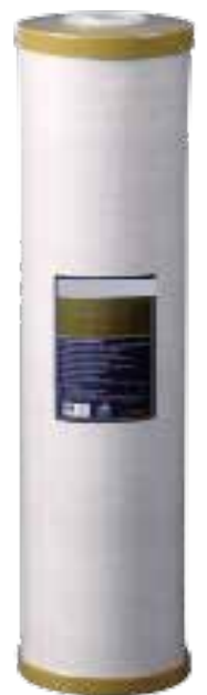
Triple Action Carbon