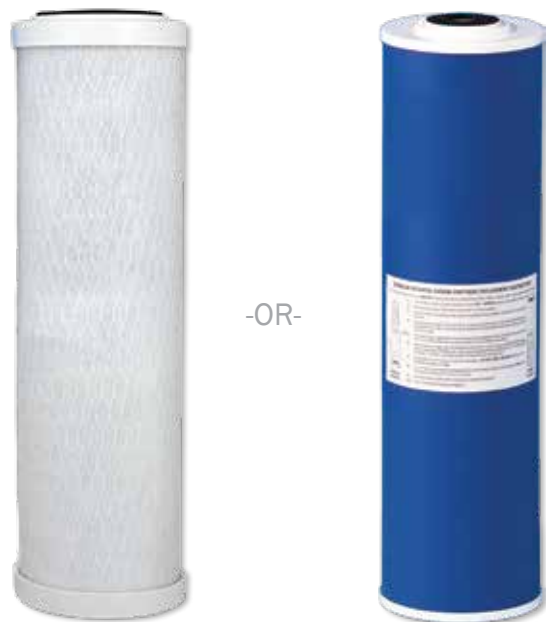
Carbon Block GAC (GRANULAR ACTIVATED CARBON)

Carbon filters employ a high grade carbon with industry-leading surface area allowing for the greatest efficiency of the carbon absorption.