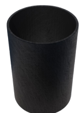
Final stage Carbon impregnated inner blanket 6mm (1/4")