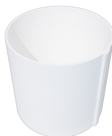
High Efficiency Pre-Filter