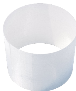
High Efficiency Pre-Filter