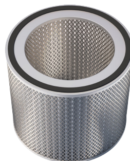
H13 Medical-grade HEPA Filter