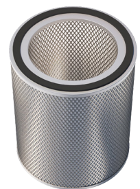
6kg (13.2lbs) Carbon Filter (Coconut Shell)