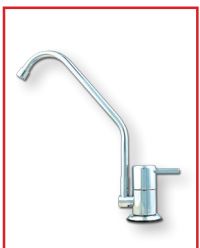
EURO Long Reach H22cm x W22cm Item #1156