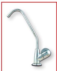
FIN H25cm x W20cm Item #1175