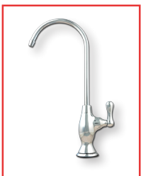
ANTIQUE H28cm x W18cm Item #1176