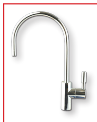
MODE H30cm x W21cm Item #1656