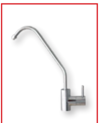
METRO H25cm x W16cm Item #1692