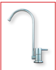
EURO High Loop H27cm x W21cm Item #1157