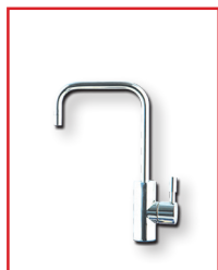
PETITE H19cm x W14cm Item #1177