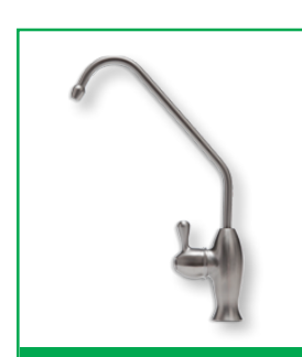
FEDERATION Long Reach H25cm x W21cm tem #2824