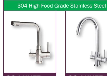
SS MIXER Standard Spout H28cm x W24.5cm