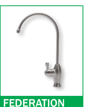
High Loop H29cm x W23cm tem #2825