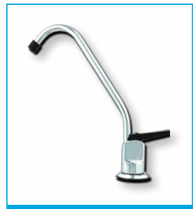
STANDARD 121cm x W20cm em #1155